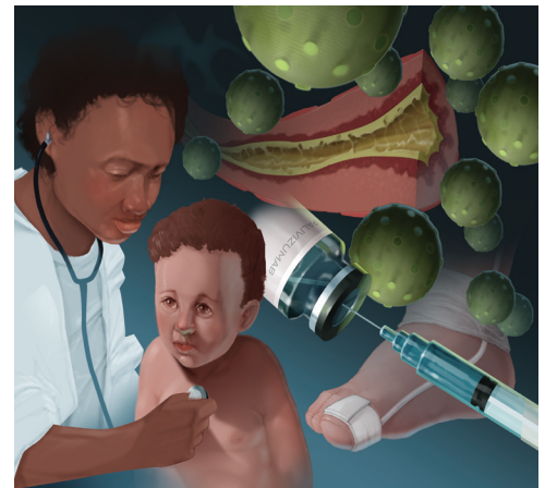
ILLUSTRATION BY MICHAEL KRESS-RUSSECK

► Patient information: A handout on respiratory syncytial virus infection, written by the authors of this article, is provided on page 149.