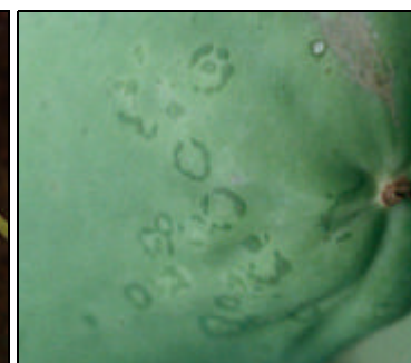
Figure 3. Close up of PRV-infected papaya fruit showing ring spots.

Damage. Since the leaf canopy of an infected tree declines as the disease progresses, fruit yield, size and quality are reduced.