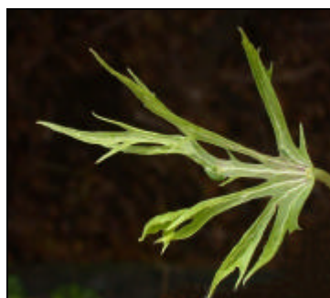
Figure 2. PRV-infected papaya leaf exhibiting shoe-stringing.

Description. Papaya ringspot is a destructive disease characterized by a yellowing and stunting of the crown of papaya trees, a mottling of the foliage (Figure 1), shoe-stringing of younger leaves (Figure 2), water-soaked streaking of the petioles (stalks), and small darkened rings on the surface of fruit (Figure 3). Other pest organisms, such as various species of mites and powdery mildew, may cause symptoms similar to PRV. Herbicides drifting onto developing papaya trees may also cause symptoms such as shoe-stringing. In severe cases, fruits may become distorted.